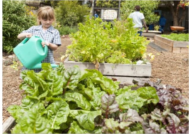
Student watering the vegetable garden

Community connections are enhanced by strengthening student, parent and community involvement with the food garden.